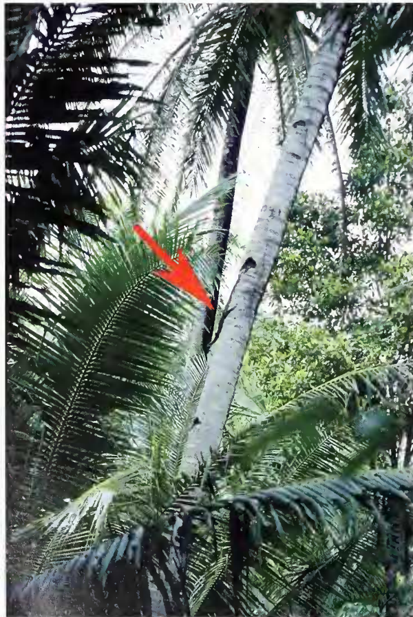
Fig. 3. Coconut and nutmeg plantations dominate the cultivated coastal landscape of Salibabu Island. Red arrow indicates Varanus sp. basking on a palm trunk.

Field studies on the east coast of Salibabu Island (ca. 95 km 2 ) were conducted by AK and EA from 13 to 21 July 2005. Collections and observations were made in the vicinity of Lirung, a settlement with a ferry landing stage. Field numbers are AK039 to AK075. The surroundings near the coastline are dominated by agricultural vegetation, especially coconut ( Cocos nucifera ) and nutmeg ( Myristica fragrans ) plantations (Fig. 3). The island's hilly interior was not intensively surveyed. In the low central hills, however, primary habitats or at least areas of minor disturbance still exist (Fig. 4). As recently recognized by RILEY (2002), and unlike the neighboring island Salibabu, large areas of Karakelong Island (ca. 970 km 2 ) are still